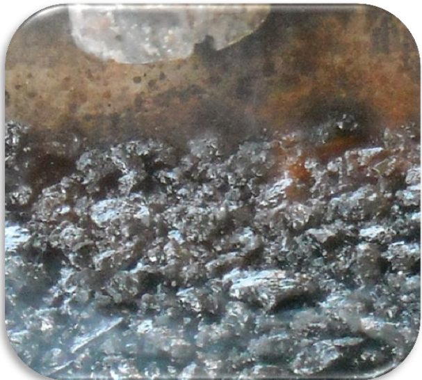
Figure 4: HMA Loose Sample