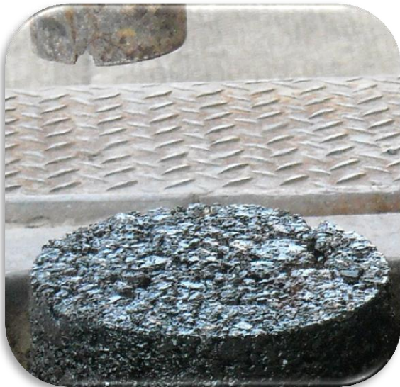
Figure 3: HMA Compacted Specimen