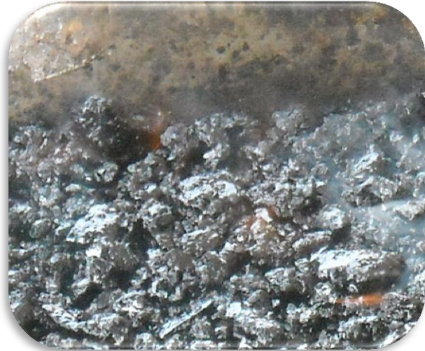
Figure 2: ARHM Loose Sample