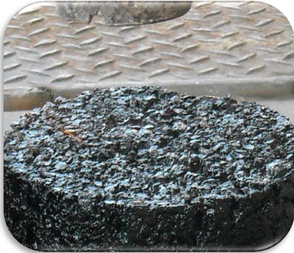
Figure 1: ARHM Compacted Specimen